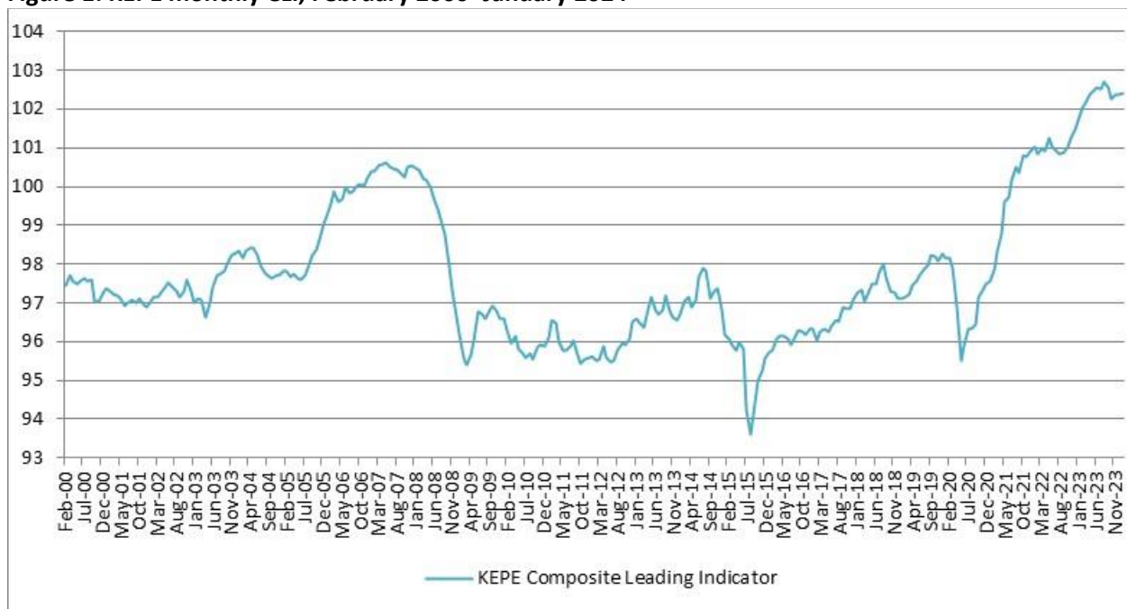
Figure 1: KEPE monthly CLI, February 2000–January 2024

The KEPE Composite Leading Indicator (CLI) is constructed based on a dynamic factor model, using six selected monthly economic series assumed to have leading properties. It provides early evidence on the course of and any turns in Greek economic activity, ahead of the developments in major economic aggregates. According to the most recent observation for January 2024, 2 the CLI recorded an increase, following the marginal increase of the preceding period of reference, and remains at high levels for the total period of investigation. The respective development supports the evidence in favor of an interruption of the recent downward trend of the CLI and a transition to a rising path. As a result, it reflects an enhancement of expectations and assessments by agents involved in economic activity, offering leading indications for an intermediate improvement in future economic conditions. On that basis, any adverse impact due to the rise of geopolitical risks is not considered to be predominant. In order to acquire additional evidence, it becomes necessary to re-estimate the CLI. The inclusion of new data is expected to offer further information regarding the course of future domestic economic activity.